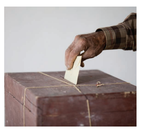
Political power. Political field experiments have provided insight into effective voter mobilization strategies.

For decades, traditional opinion surveys have shown that many citizens cannot recall seemingly basic political facts, such as which political party controls a majority of