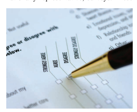
Your opinion counts. In survey experiments, political scientists explore how the attitudes, perceptions, and emotions of citizens affect their responses in opinion surveys.

Political scientists commonly use three different experimental methods. Laboratory experiments place subjects in situations that show how people reach decisions as voters, jurors, or legislators. Political scientists also embed experiments in large, and often nationally representative, surveys. These